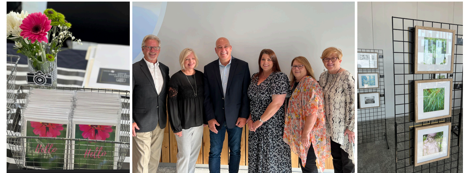
Gather For Good Event, August 25th: Olathe Indian Creek Library

This wonderful event supported our Lakemary Fund A Need.