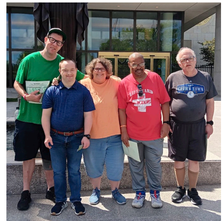
A fun day at the Federal Reserve Money Museum!