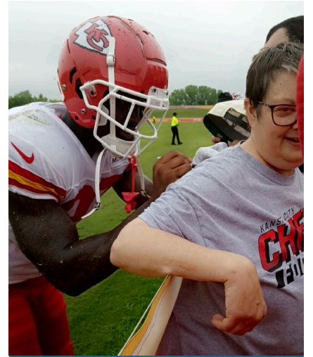
Some of the adults enjoyed a day at Chiefs training camp!