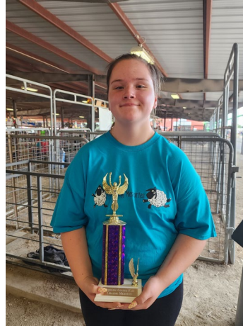
Students showing off their skills at the Johnson County Fair