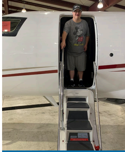
Adults enjoying a fun day at the Johnson County Airport