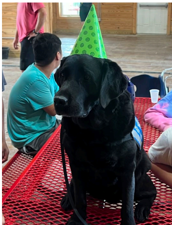
Celebrating Patch's 7th birthday!!