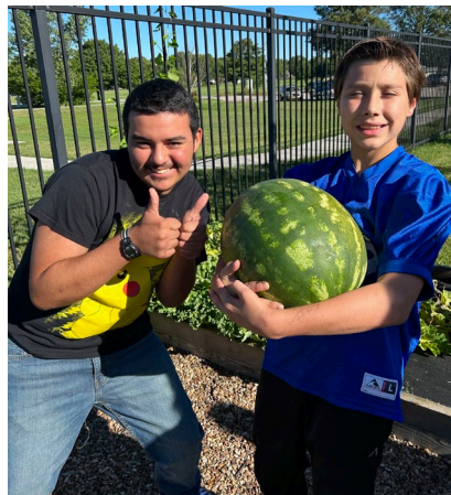
Students love seeing the "fruits" of their labor!